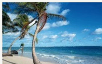
Most competitive travel deals and vacation packages