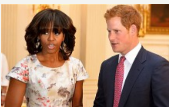
Prince Harry in the US