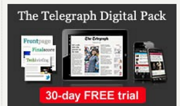
Try The Telegraph for iPad free for 30 days