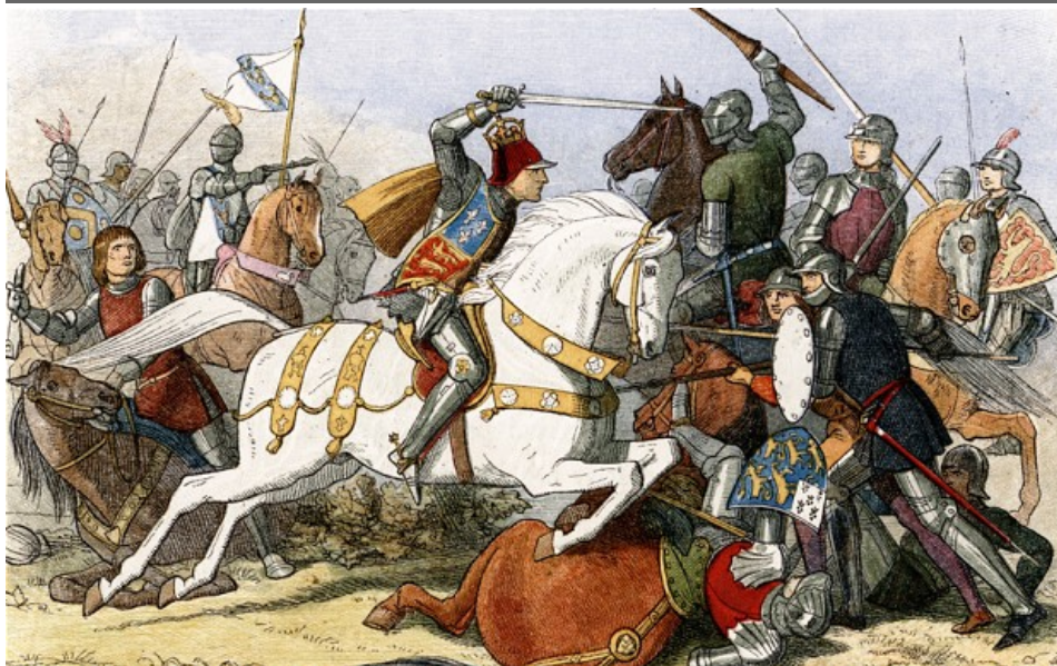
Richard III

Human remains found in the resting place of Richard III have already been identified as those of the king but information is being held back ahead of a major press conference next month, sources close to the project claim.